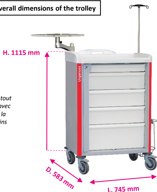
Overall dimensions of the trolley

Les cotes hors tout sont relevées avec les roues dans la position la moins encombrante.